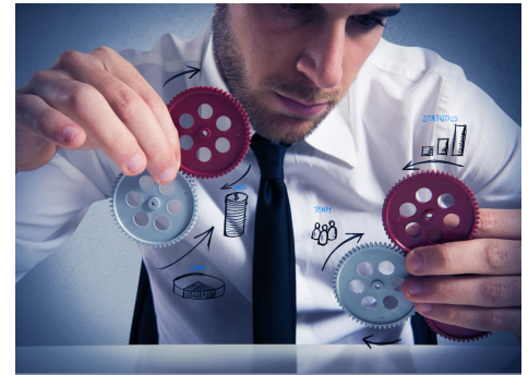
Autopilot Business Systems

How is it that some business owners seem to be working less hours and lack the marketing skills of their competitors, yet they are still able to scale and grow their business? You will find these entrepreneurs have simplified, systemised and automated large parts of their business 'machine'. The business doesn't rely on them to crank up the engine every day which reduces the risk for potential buyers because the business is not totally reliant on the owner. Too often a business run by a technician grinds to a halt when they aren't 'on the tools' or are sick. They find it difficult to take time off and rarely have a decent holiday. They build strong relationships with their key customers which might prove difficult to transition to the new owner. All these